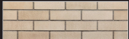
Desert Land | King Size